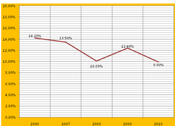
Figure 2. Percentage of inmates with mental retardation (UPPQC).

Table 3 shows the percentage of inmates who have been diagnosed with mental disorders in prison psychiatric hospitals depending from the General Secretariat of Penitentiary Institutions, where a high prevalence of intellectual disability has also been spotted (around 7% in the 2007 revision).